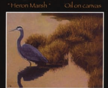
"Heron Marsh" Oil on canvas

Sawgrass Village Tu-Sat 12-6 904.285.1020