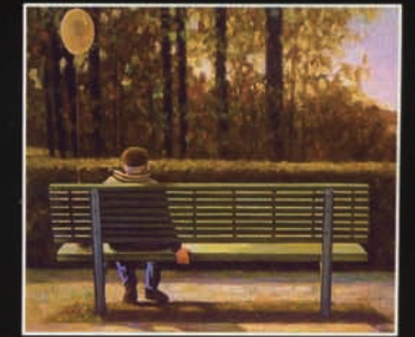
"A Yellow Balloon Day" Oil on canvas